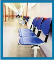
DOCTORS & DENTISTS

Radic8 is an all-in-one solution for air quality problems in a wide range of market sectors and providing cutting-edge surgically clean air for industrial, commercial and home environments.