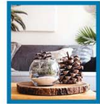
FOR YOUR HOMES