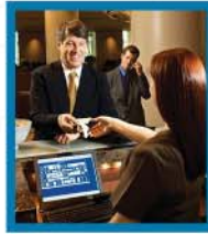
HOTELS & RESTAURANTS