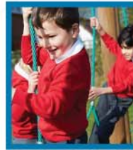
SCHOOLS & UNIVERSITIES